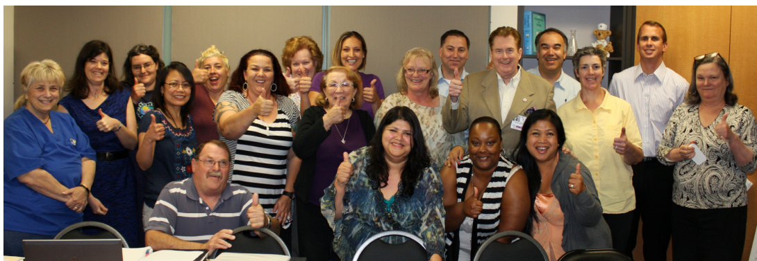
Our 121RN Bargaining Team and hospital management after signing the tentative agreement on June 27.