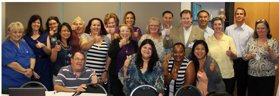
Our 121RN Bargaining Team and hospital management after signing the tentative agreement on June 27.