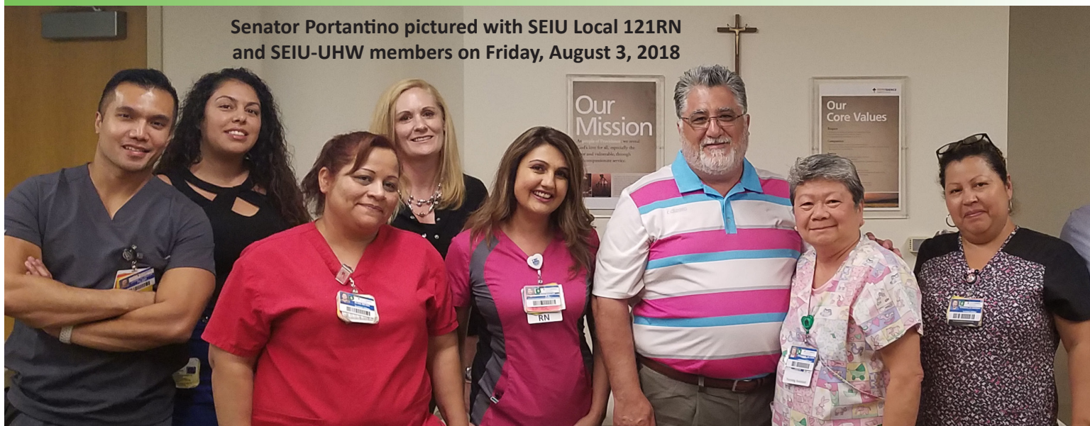
Senator Portantino pictured with SEIU Local 121RN and SEIU-UHW members on Friday, August 3, 2018